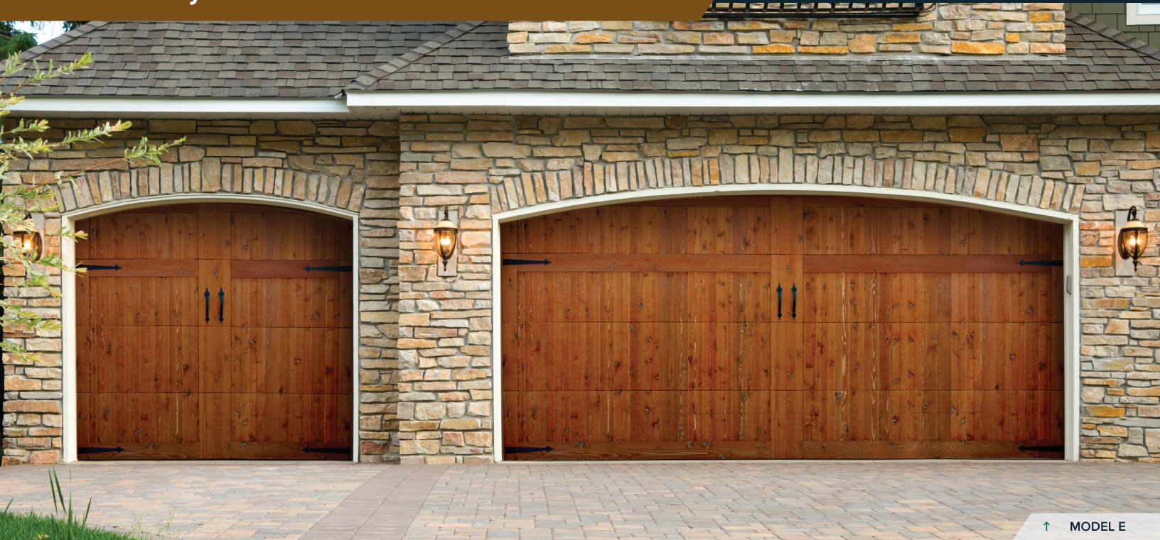
↑ MODEL E