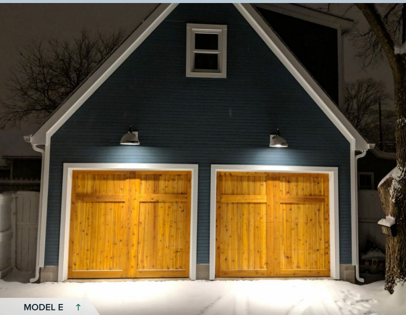
MODEL E ↑