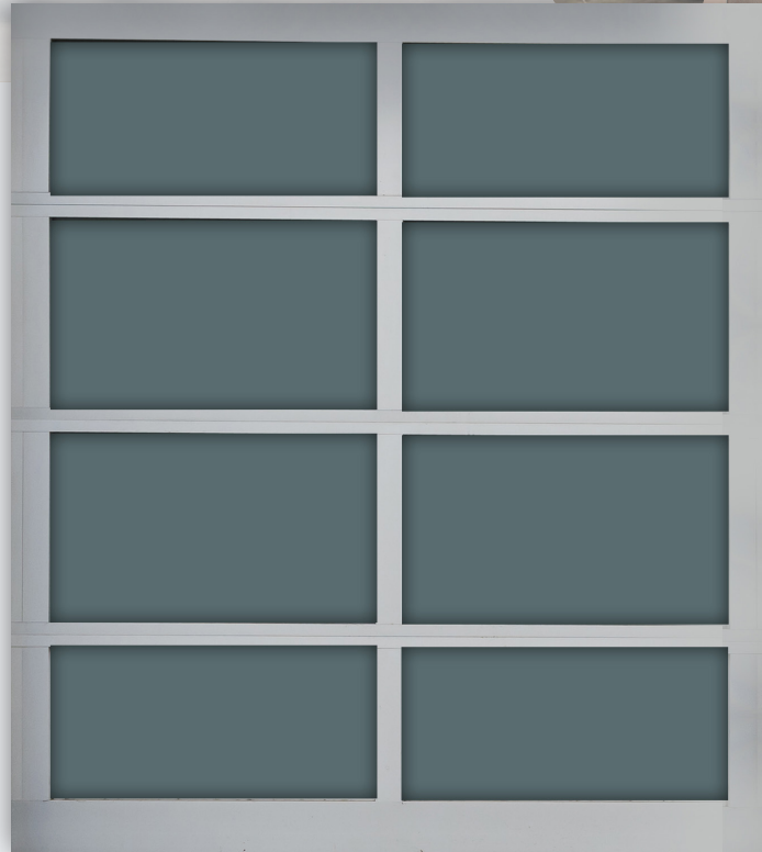
↑ CLEAR ANODIZED WITH SATIN GLASS