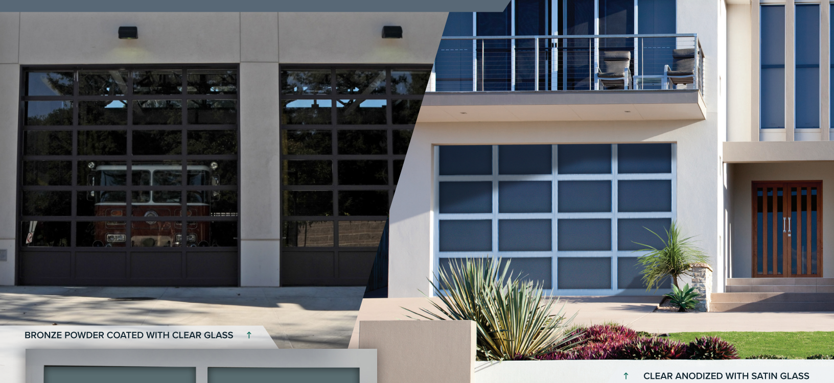
BRONZE POWDER COATED WITH CLEAR GLASS ↑